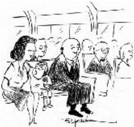
GRANDPA REALLY DOESN'T LIKE THIS PREACHER — HE TURNED OFF HIS HEARING AID

Ivy Bluff church of Christ, June 4-7, 7:00 pm. Theme: Death, Resurrection and Ascension of Christ.