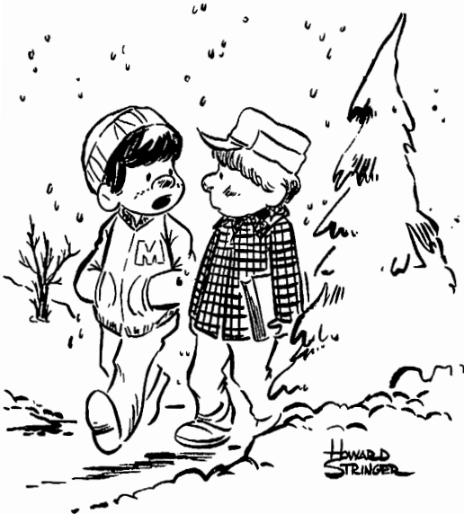
"I THINK GOD MAY HAVE A PROBLEM...I'VE BEEN PRAYIN' THAT IT SNOWS SO HARD THEY HAVE TO CLOSE SCHOOL.. MY MOM IS PRAYIN' THAT IT DON'T."

There is a list on the bulletin board for those willing to prepare the communion for 2018.