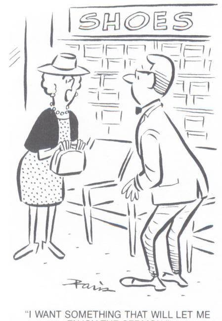
ENJOY THE SERMON.