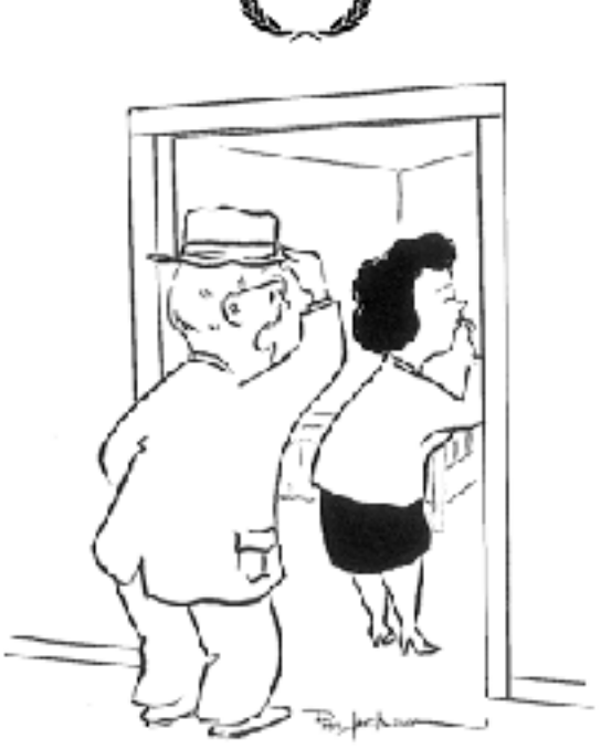
"HURRY UP, WOMAN! WE GOT TO GET TO CHURCH EARLY OR WE WON'T GET A DACK SEAT."

The job will consist of working for four hours a day, two days a week for a total of 8 hours. The primary task would be preparing the Bybee Banner for mailing on Tuesday mornings. Other assignments would include things like preparing bulletin boards, ordering of literature, and etc. If you would be interested in this position, please submit a resume' to one of the elders by this coming Sunday.