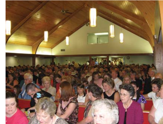
About 10 minutes prior to services the building was already full.