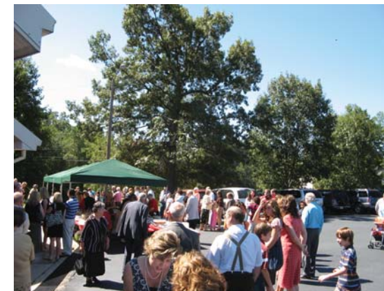
Between 300-400 stayed for the meal served to our guests. The Lord blessed us with a perfect day to eat outside.

What an awesome day, September 12, 2010 was! A new record attendance of 536. A new record was also set for the class attendance at 405.