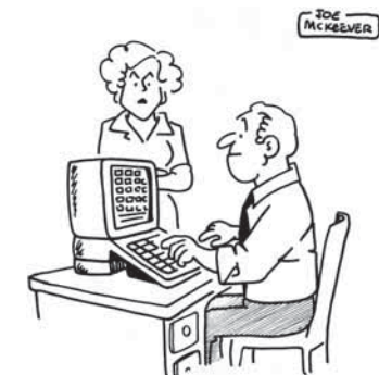
OTHER PREACHERS USE COMMENTARIES TO GET UP SERMONS, BUT NO—YOU'RE TOO GOOD FOR THAT!